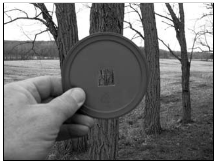
A tree filling the angle gauge window.

your angle gauge. Or, having measured your arm length refer to the chart below to determine your needed window size. If