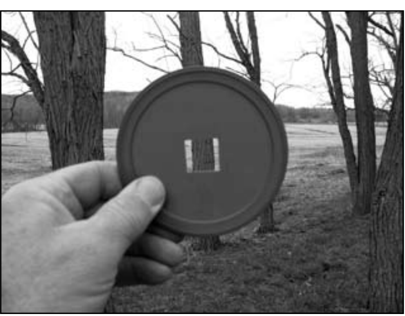
A tree too small to fill the window.