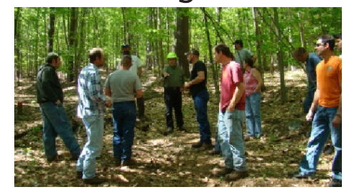
A group of loggers during a forest ecology & silviculture class at Pack Forest.

The TLC program includes three core components for initial certification: First Aid and CPR; Chainsaw Safety and Productivity (Game of Logging Level I); and Environmental Concerns (Forest Ecology and Silviculture). The initial certification is good for only three years, and once certified, individuals seek out continuing education courses to maintain their Trained Logger Certification. Of the core component courses, the environmental concerns course in the initial certification probably has the greatest direct impact