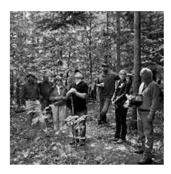
On the new Sustainable Forestry Trail