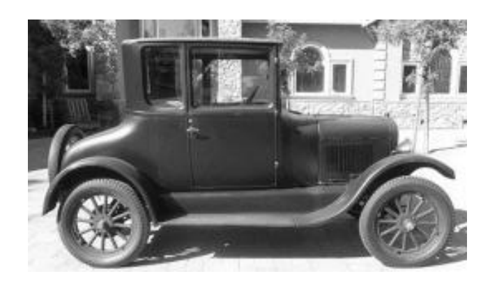
Clue #3 - Was It This?