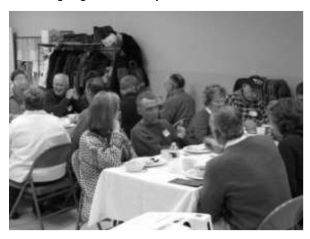
Holiday Gathering dinner

declining and the mature forest birds seem to be increasing, again for many different reasons.