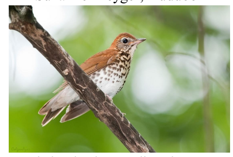
Wood Thrush.

between Audubon New York, Watershed Agricultural Council, New York Tree Farm Program, and New York Forest Owners