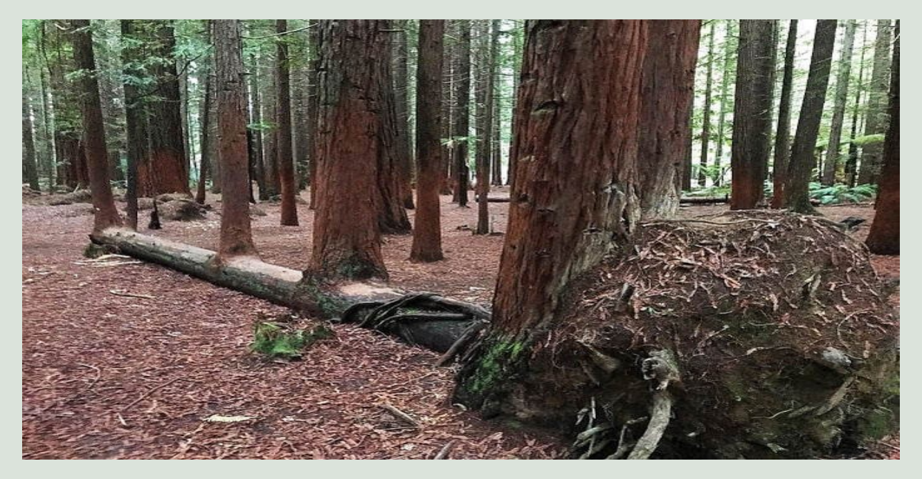
This tree fell over and cloned four trees