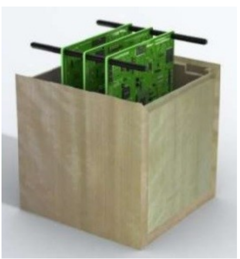
Photo: Japan plans a 2023 launch of the world's first satellite made out of wood.

The engineers at Kyoto University aren't using plywood or OSB board, obviously. Researchers from the University of Maryland, the National Institute of Standards and Technology, and other institutions have found various ways to make wood super-strong and amazingly light and thin.