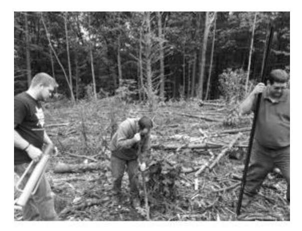
Volunteers installing exclosure fence

Cornell Cooperative Extension of Columbia and Greene Counties with funding assistance from NYFOA's Capital District Chapter, installed two deer exclosures in their Siuslaw Model Forest in Greene County. The purpose of the exclosures is to help landowners and others see first-hand the impact that deer have on forests, especially regeneration. The information will also be useful for landowners to see how they can install a fence to prevent losses due to deer on their own property. One of the exclosures will also help to determine the feasibility of oak regeneration in an oak stand that had a selective timber harvest.