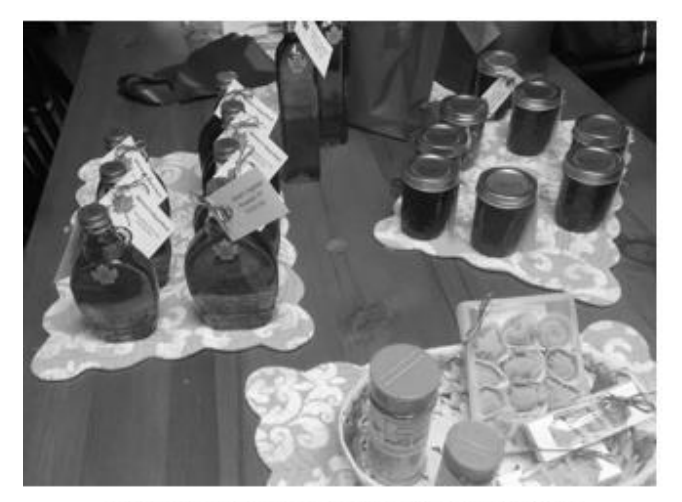
Maple products from Skinners sugar bush

more time collecting sap. He continues to improve all aspects of his operation.