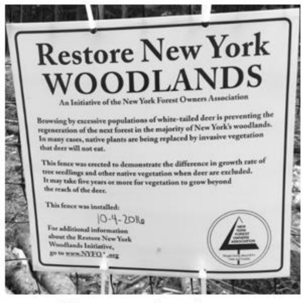
Signage on exclosure fence