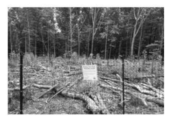
The finished exclosure