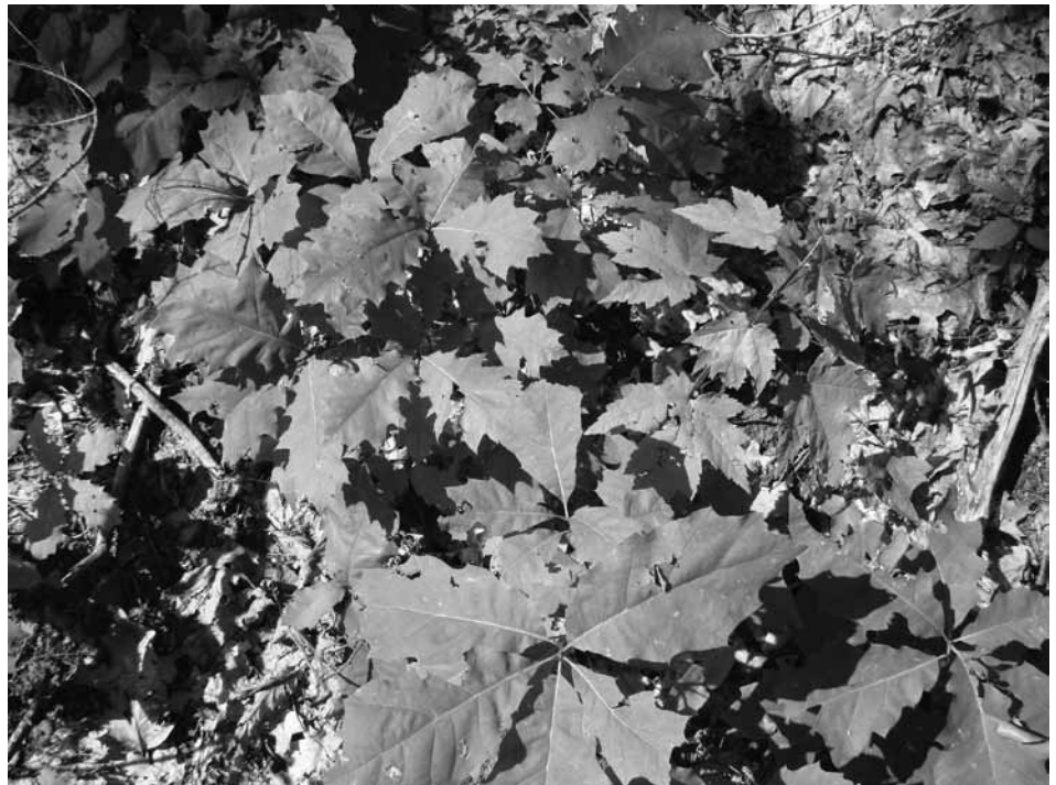
The life of a seedling is precarious. A tree may produce thousands of seeds, but only a small percentage usually germinate, establish, and grow. The long lives of trees allow for many years of failed regeneration needing only one or two successful years, but constraints on regeneration that are enduring and widespread can eventually change the nature of the forest.

Tree regeneration, our focus here, requires the coincidence of (i) the availability of propagules, (ii) the receptivity of the site (the seed bed) for the seedling to become established, and (iii) adequate growing conditions at the site for the seedlings to grow toward maturity. If the timing or quality of one of these three factors doesn't align, regeneration fails. It may require years for trees to become sexually mature and for owners to conduct specific management activities to create an appropriate seed bed and growing conditions. Thus, regeneration is a process through time.