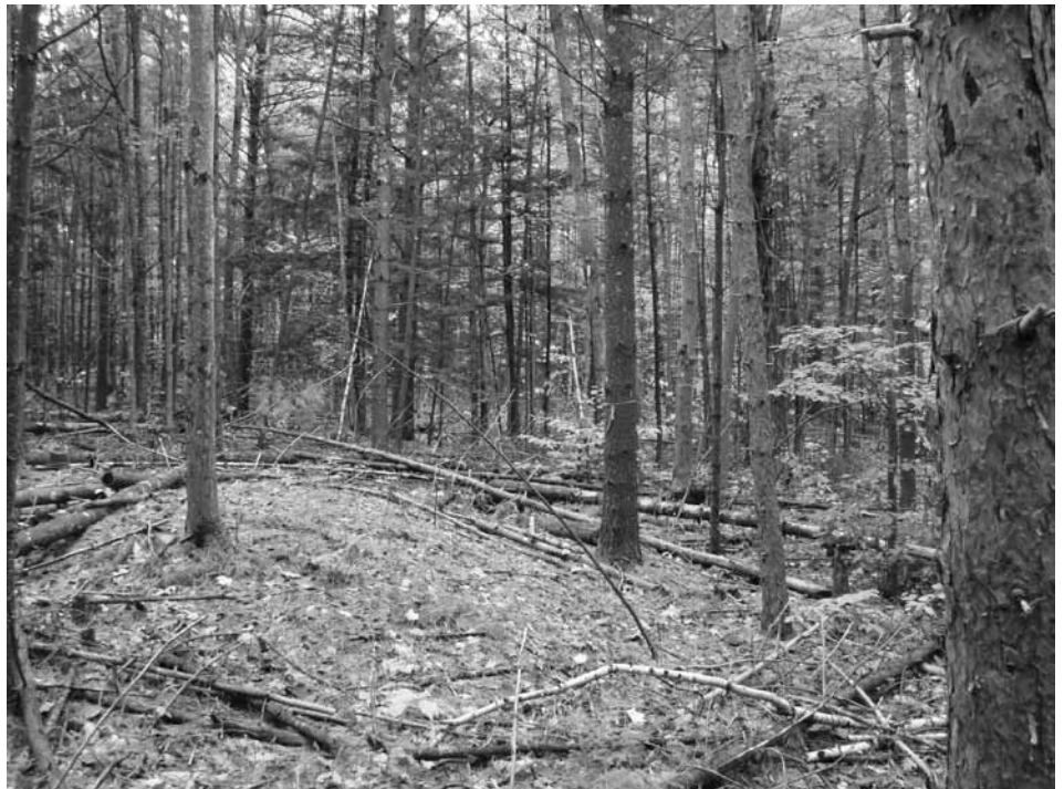
A 50 year old private forest in the Adirondacks. Little understory has developed in the oak/pine stand, but future years will bring changes. How will this stand look in 50 years and what pressures will bear on the next forest?

In a simplistic way, we can think of the forest as two layers; the upper canopy and the understory. In forests less than about 40 to 50 years of age, we seldom worry about understory layer, or regeneration, because the forests have a long time horizon. At about 75-100 years old however, the concern for regeneration should heighten because some tree species may be approaching the end of their life cycle and/or sawtimber species maybe financially mature. At this point in a stand's development any natural or man-induced alteration of the upper canopy will provide sunlight to the plants in or on the forest floor and favor their expansion and abundance. An ice storm or prolonged insect defoliation, for example, might not fully destroy the overstory, but could provide sunlight to entrench the existing understory. Entrenching the existing understory is good if it has a desired mixture of quality seedlings. Unless the understory is changed, the species present at the time of a canopy disturbing event will