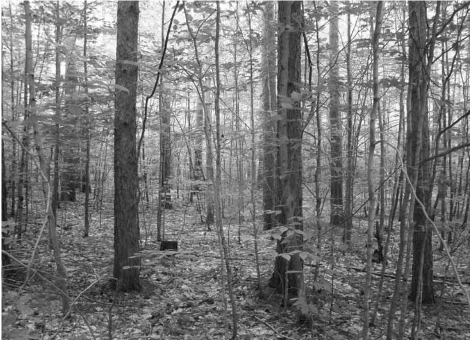
What you see is what you get. American beech has become established and dominant in the understory of this 80 year old red pine plantation. Without owner intervention, the next forest is likely to become a beech forest.

species can dominate and the habitat can become unsuitable for some desired wildlife.