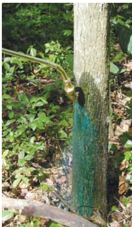
Basal bark treatment spraying lower 12–18 inches of stem.