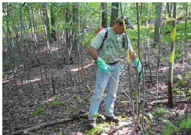
Applying Garlon 4 summer treatments to black birch in the West Branch Forest.

The thin-barked species examined in this study (beech, striped maple, red maple, black birch, and hophornbeam) are effectively controlled using herbicide concentrations of Garlon 4 (61.6 percent triclopyr) as low as 1 percent depending on the species and time of year the application is made. This rate is much lower than the traditional 20–30 percent normally recommended for low-volume applications. Using identical equipment and making similar applications, we were able to achieve greater than 75 percent control for all species studied by applying a 5 percent Garlon 4 solution in the spring. Similar results were achieved when applying 5 percent solutions in summer on all species examined, with the exception of hophornbeam. Use of these lower concentrations could reduce herbicide costs by more than 75 percent.