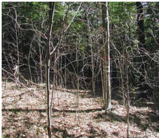
Results of the 5 percent summer beech plot.

Basal bark herbicide treatments allow for targeted vegetation control with little danger of off-site and nontarget species damage. Basal bark applications are well suited for treating small-diameter stems (less than 6 inches in basal diameter). They are applicable for small ownerships and steep terrain often encountered in the Appalachians. Basal bark herbicide applications provide seasonal application flexibility, and using triclopyr, a wide range of species are controlled. The herbicide is non-restricted-use, meaning that forest landowners can purchase and apply it to their own properties without certification.