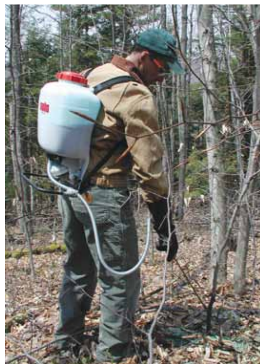
Treating American beech stems in northern hardwood understory.