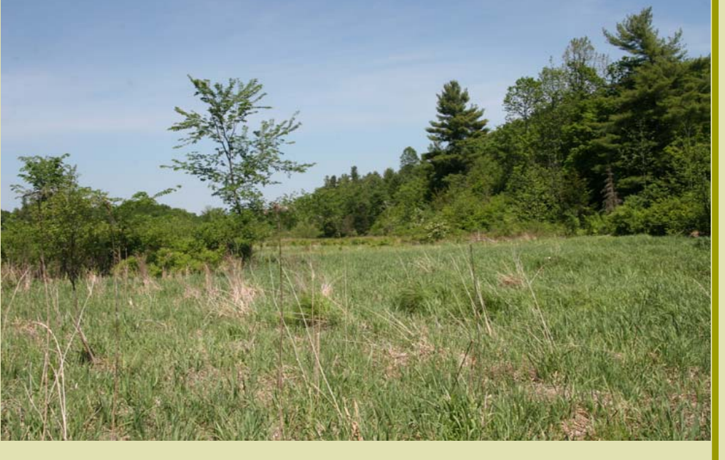
A collaborative effort of:

Cornell Cooperative Extension, the New York State Department of Environmental Conservation, and New York Forest Owners Association