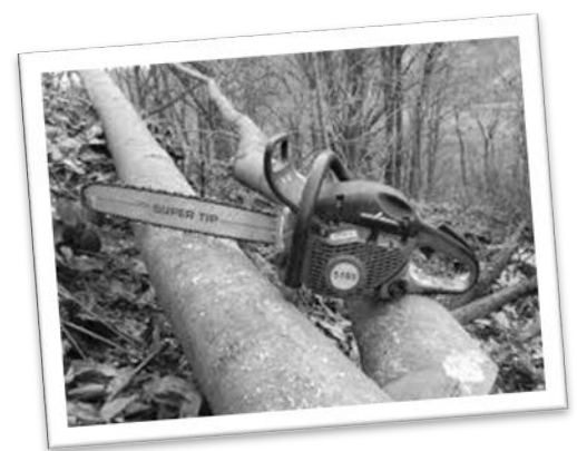
Dolmar PS-5105 chainsaw

Please register by April 4<sup>th</sup>. Registration fee is $20, $15 for students. For registration form, more information, driving/parking instructions see the home page of www.nyfoa.org.