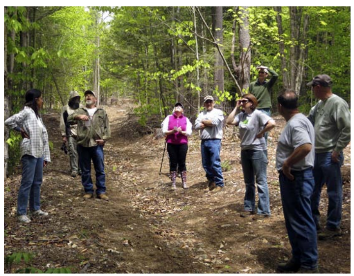
Attendees participate in a tree identification contest