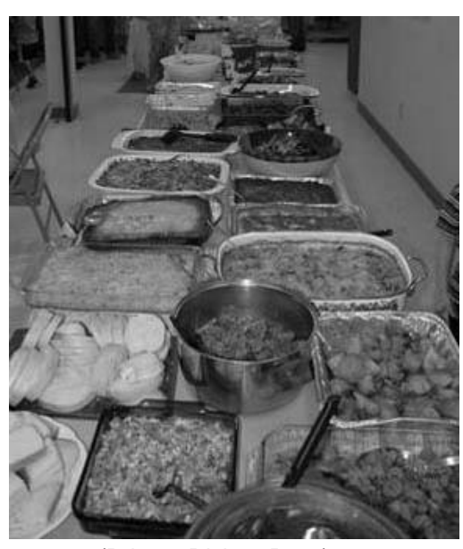
(Bring a Dish to Pass)

Directions: From the north – take 787 south to exit 7W (rte 378) and bear right on the ramp to route 32. Turn left onto rte 32 (Broadway). At the first traffic light turn right onto Menands Road. The church is on the left on the first corner after you cross the railroad tracks. From the south – Take 787 north from Albany to exit 6. At the end of the exit ramp turn right onto rte 32 (Broadway). At the first traffic light turn left onto Brookside Ave. Take Brookside to the end and turn right on Lyon Ave. The church is on the right after two blocks.