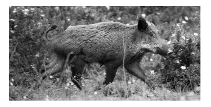
Feral Swine in NYS

In New York, people with a small game license may shoot and keep feral swine at any time and in any number. All other hunting laws and firearms regulations are still in effect when shooting feral swine. If you do shoot or see feral swine please report it to the nearest DEC regional wildlife office. Please report the number of swine seen or killed, whether any of them were piglets, the date, and the exact location (county, town, distance and direction from an intersection, nearest landmark, etc.).