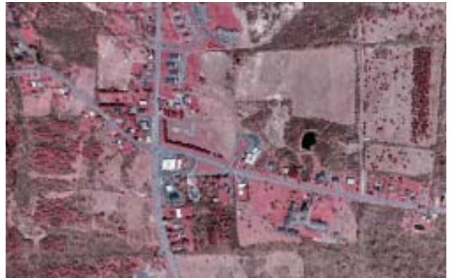
Looking at your property as part of the "big picture" can help you determine what habitat elements are needed. On this large, unbroken areas of forest are rare.

Once you have assessed habitat and wildlife on your land, acquire an aerial photo and topographic map of your property. The Soil Conservation District office or the Farm Services Agency (FSA) office in your county or area often has aerial photos for you to view and order. Aerial photos and topographic maps are available on-line at http://terraserver-usa.com/ . Get the "big picture" perspective of our neighborhood to determine which habitat components are plentiful or scarce on your land and adjacent ownerships. The home range size