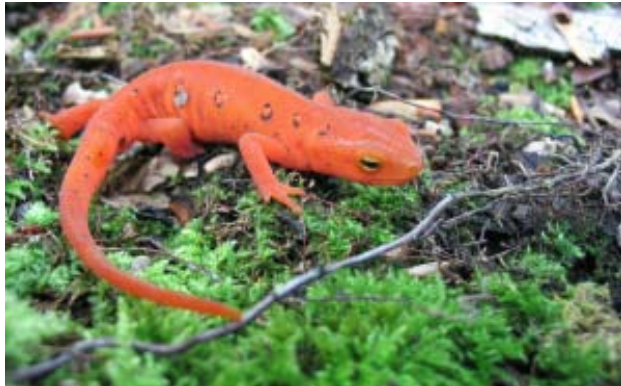
Red Eft: More than two months after hatching, eastern newts transform from aquatic, gilled larvae to air-breathing terrestrials. During this land phase, they are known as efts.

At some point in time, nearly everyone finds enjoyment in wildlife. As a home or landowner, you have the opportunity to benefit from the aesthetic, recreational and economic rewards that come with safeguarding and managing your land in ways that allow for and respect the needs of wildlife.