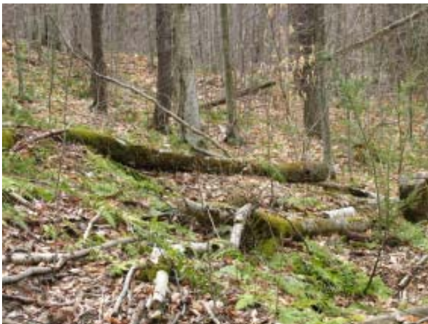
Leaving dead wood on the forest floor provides habitat for amphibians, reptiles, small mammals, and invertebrates

Landowners who retain a few dead standing trees (away from trails, buildings and other high-traffic places where they might present a safety hazard) will be delighted to see woodpeckers, birds, and other animals feeding on the insects and fungi attracted to the decaying wood.