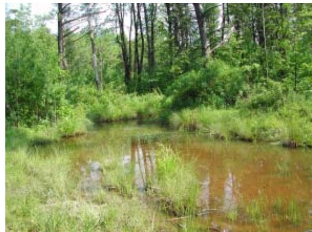
Water sources, such as wetlands, streams, vernal pools, ponds, and spring seeps provide a critical element of wildlife habitat and can provide landowners with many wildlife viewing opportunities.

In some circumstances, it may be feasible for you to create a backyard pond. It need be no larger than 3 or 4 feet in diameter. Some homeowners add small ponds to attract frogs and toads to their gardens. Frogs and toads eat a wide variety of insect pests and slugs. Assistance with planning your pond is available from local agencies including Cornell Cooperative Extension, your County Soil and Water Conservation District, and the New York State Department of Environmental Conservation.