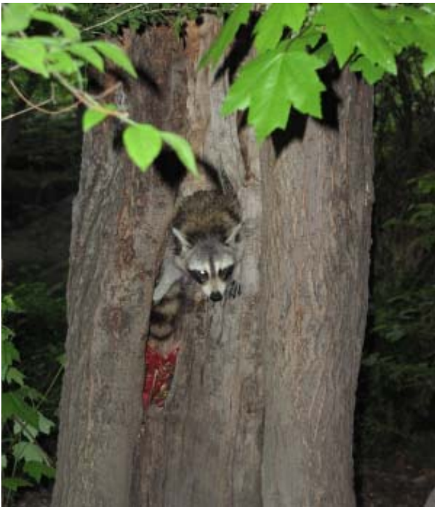
Holes, or cavities, in trees provide refuge for many wildlife species.

You probably know the number of acres your property covers, but did you know that space available for attracting wildlife extends vertically as well? Trees, shrubs, and vines of varying heights provide a full range of 'suites' for animals that climb and fly. The good news is that you can encourage increased vertical structure in your woodland through management practices like thinning - which increases sunlight and in turn promotes understory growth and forest renewal.