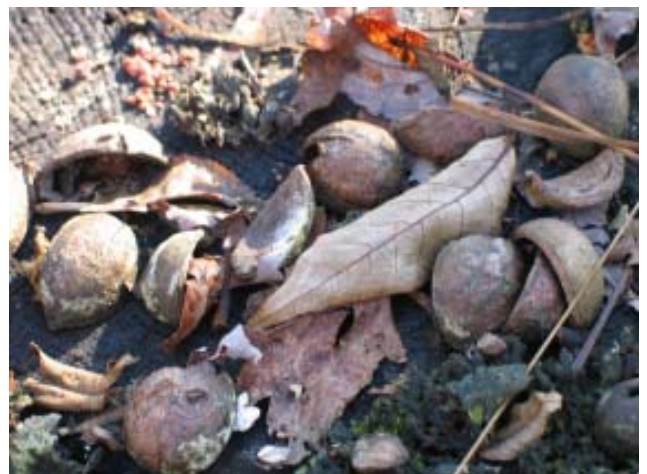
Hickory nuts provide food for many wildlife species.

To provide food for wildlife, promote the health and growth of good wildlife food-producing trees such as oaks, hickory, beech and black cherry. Nuts, such as acorns, hickory nuts, or beechnuts provide food for chipmunks, squirrels, turkeys, bears, and others. You can promote the growth of these valuable trees by culling (cutting) less desirable trees that compete with your food-producing trees for light. Cutting